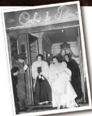
PRINCESS MARGARET LEAVES THE CAFÉ DE PARIS IN THE 1950S

SPECIAL OFFER 10% discount (£90 per person) if your cheque reaches our office by December 18th (see details and address below).